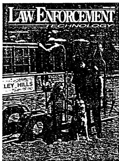
On the cover: